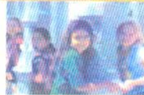
Beverly Hills girl scouts took in the sights at LACMA last month. 4