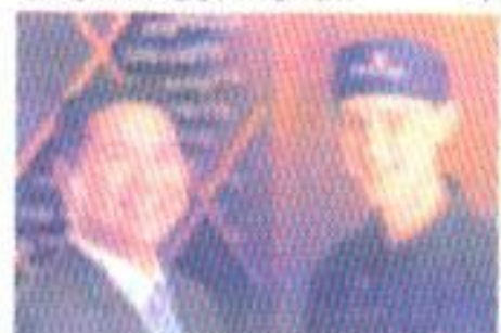
Fleming's Prime Steakhouse is almost ready for its Beverly Hills Debut. 4