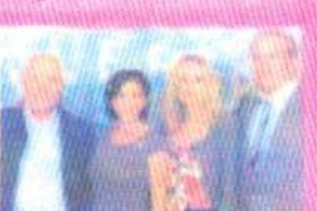
The Beverly Hills Hotel hosted a Beverly Gardens park restoration party. 26