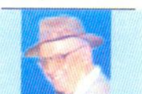
• Arts & Entertainment 20 • Birthdays 28

George Christy, Page 6 Four Seasons Hotel Toronto Hosted its 28th Annual Luncheon During the Toronto International Film Festival, previewing its New Flagship Hotel, a Stunning Addition to the City Opening Oct. 5