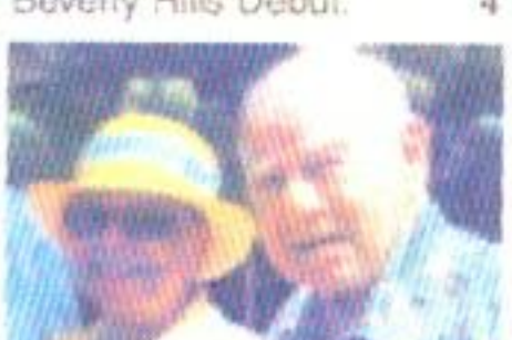
The Beverly Hills Adult Club attended the Senior Health Fair. 5